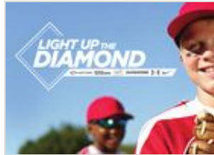
SPORTS AUTHORITY VALID UNTIL FEB 19