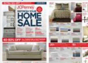
JCPENNEY SNEAK PEEK