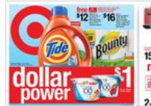
TARGET 3 DAYS LEFT