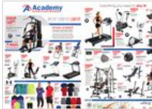
ACADEMY SPORTS + 3 DAYS LEFT